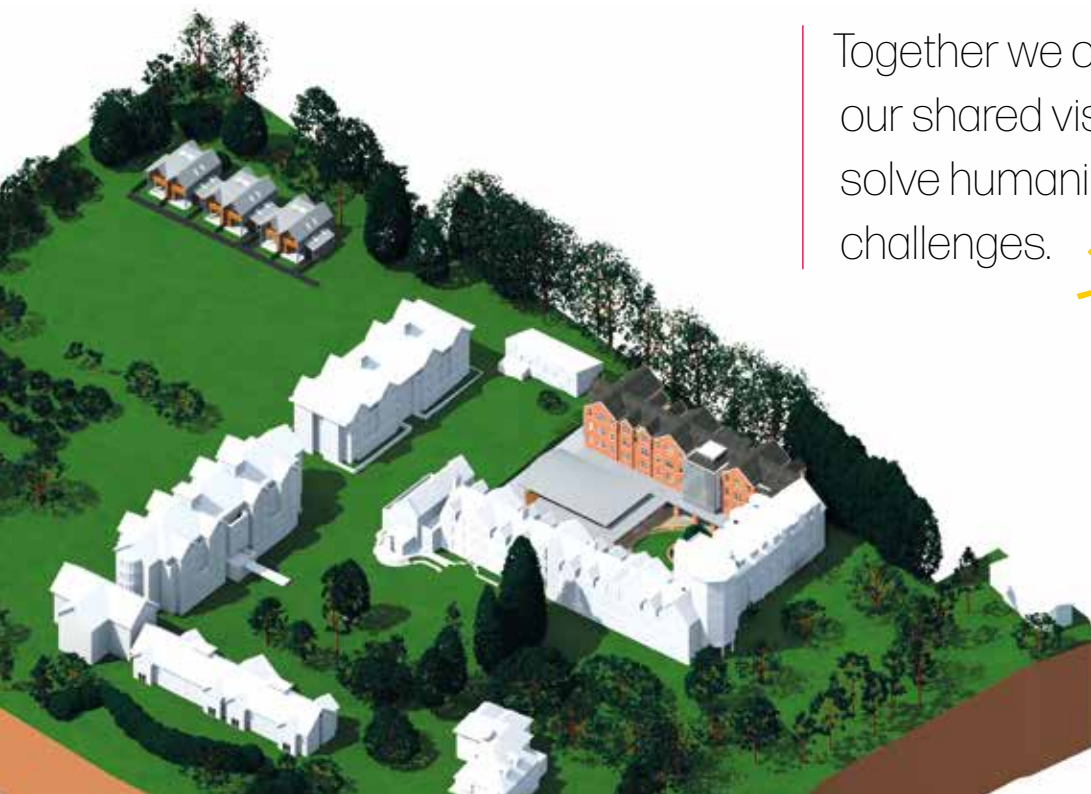
Artist's impression of proposed estate development